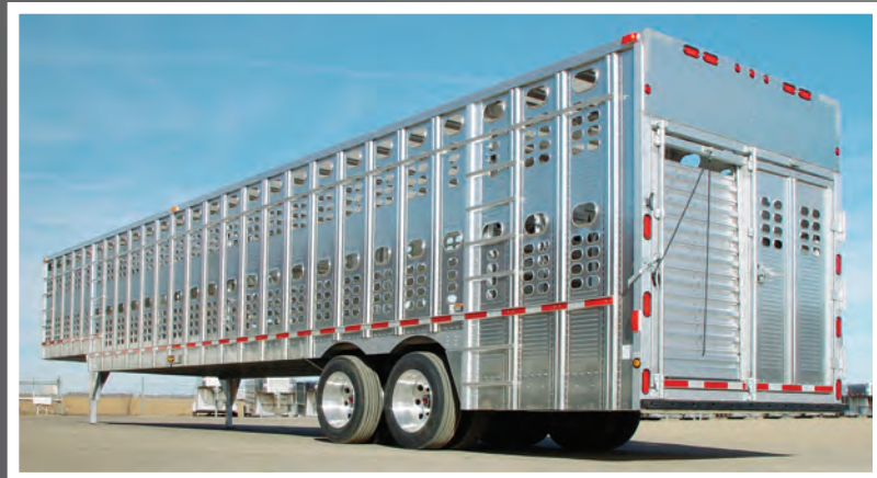
Model: PSAGL: Punch Side Aluminum Ground-Load Livestock

The StockMaster Punch Side Aluminum Ground-Load Livestock Trailer has a lowered rear threshold providing the convenience of loading and unloading almost anywhere without adjustable chutes. The riveted aluminum construction consistently delivers durability and value that has been time-tested by loyal Wilson customers for over a century. With StockMaster's smooth inside skin, superior ventilation, and minimum step-up, these same Wilson customers have confidence their valuable cargo will be delivered safely, securely, and successfully with minimal stress and strain.