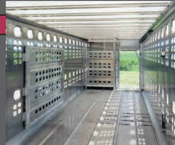
Inside View from Front to Rear. Smooth Interior Walls and Full Wrap-Around Hinge Collars Protect Against Livestock Bruising. Kemplite Roof for Visibility.