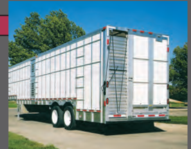
Protection from the Elements is Provided with the Addition of a Winter Kit Made of Lightweight Corrugated Panels as an Extra Cost Option.

Notice: All visual representations, dimensions, and specifications contained in this literature are based on the latest product information available at time of publication approval. The right is reserved to make changes in materials, equipment, design, specifications, and models, and to discontinue models.