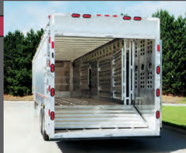
Full Swing Door with Full Width Ramp for Straight-Through Loading and Unloading.