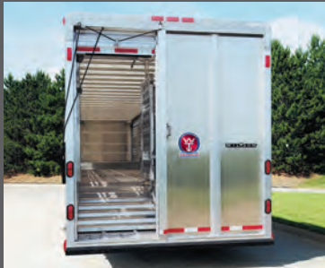
Left-hand Rear Roll-up Door (standard) and Reduced Step Ramp with Fold-to-Corner Bull Bar.